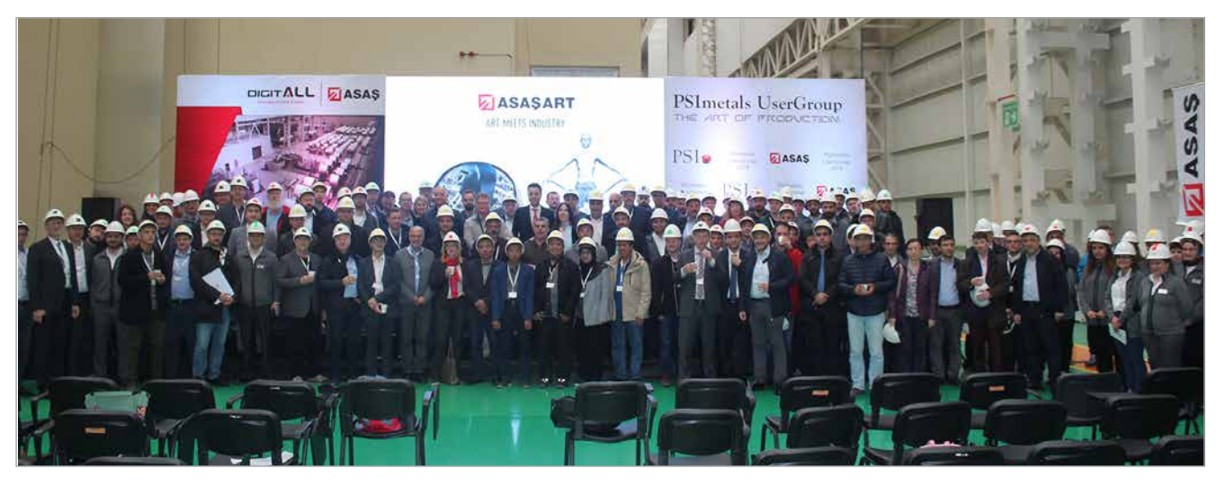
PSImetals UserGroup in Istanbul in 2018.

to OD, the task can be completed in seconds and free from possible human error.