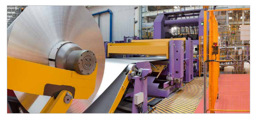
A look inside the ASAŞ plant.

In 2021 and beyond, we aim to expand the use of big data analytics, paving